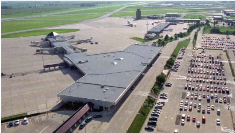
The Eastern Iowa Airport, Cedar Rapids, Iowa.